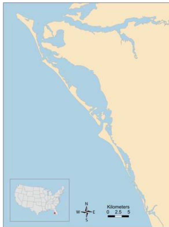
Blank Map of Sarasota Bay

After playing the rancho game, players should seek out some of the places around Sarasota Bay and the Manatee River used by the ranchos. There is no place commemorated for the ranchos but there are many locales around Sarasota Bay and the Manatee River that were used by the rancho industry and several of those sites were built upon by later settlers, who are central to the modern history of Sarasota and Manatee.